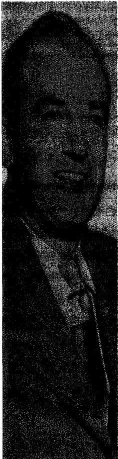
Sen. Joseph R. McCarthy... Reds are in State department.

Sen. McCarthy, en route to Reno, Nev., to address a Lincoln dinner Saturday, stopped here to attend the local banquet in Newhouse hotel.